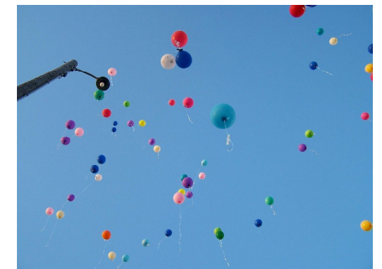
as our balloons soar .....